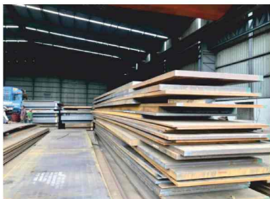
Saima E350 BR/ BO/ C/ S355J2+N & E450/ E550 BR Coils/Sheets/Plates