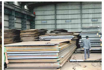
P20 & P20+NI Plates -Rockhard