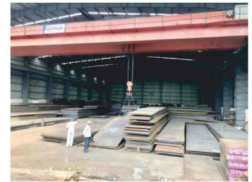
Boiler Quality Plates SA 516 Grade 50/ 60/ 70