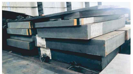
HR Slabs upto 600mm