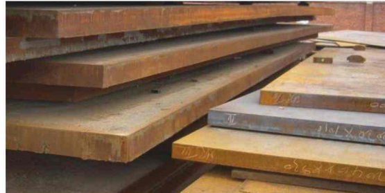
Corten A steel Plates IRSM 41/97, SAILCOR S355J2W+N, E250 C CU Coils/Sheets