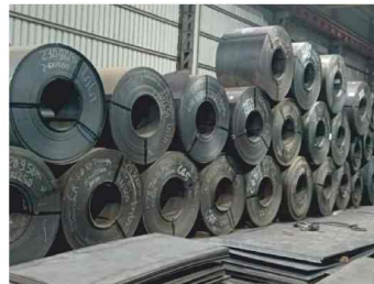
HR, HRPO, CRCA, GP/GI Chequered Coils & Sheets