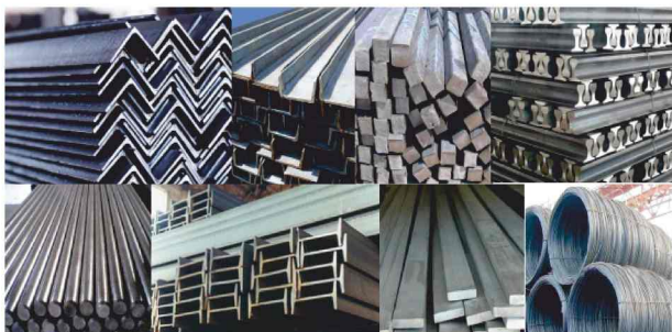
MS Structural - Angle, Channel, Joist, Flat, Round, Square, Rail, Pipe-Seamless/ Erw, Binding Wires, Wire rod, Aluminium Sheet, SS Sheets, TMT Bars etc,