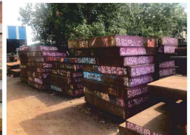
C45/EN8/EN19 Slabs & Plates