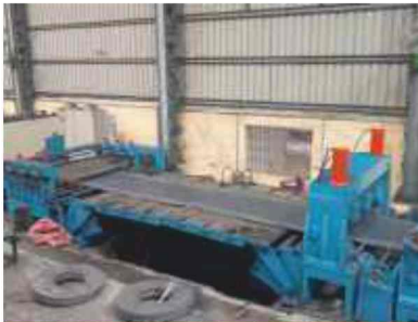
S690QL/Weldox 700/Strenx 700 Quard 700 Sheets/Plates