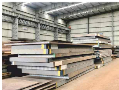
Rockhard/Hardox/ Rockstar / Abrex /Quard 400/450/500